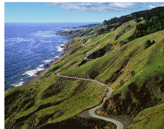
THE ROAD TO FLOWERS

Flowers wines are a reflection of the unique climate, soils, ocean proximity, exposures and rugged nature of the extreme Sonoma Coast. The Pacific Ocean is just 2 miles from our estate vineyards generating cooling sea breezes and coastal fog to create an ideal growing environment for Pinot Noir and Chardonnay. Minimal intervention in the cellar leads to purity of flavor, complexity and true balance of wines. The result is distinctive minerality, fresh acidity, bright fruit character and a hint of coastal salinity. Wines that speak to place.